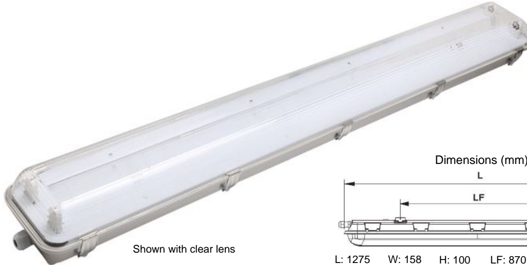
Shown with clear lens

Project Reference: _____ Fixture Type: _____ Cat. No.: _____ Voltage: _____ Options: _____