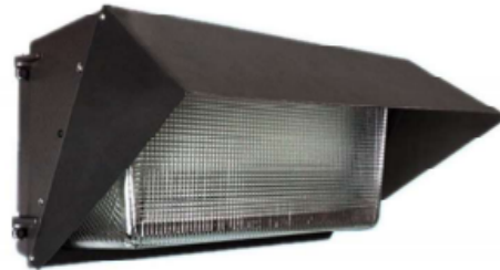
Optional reflector cover