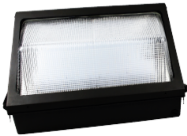
Standard bronze finish and glass refractor

Project Reference: _____ Fixture Type: _____ Cat. No.: _____ Voltage: _____ Options: _____