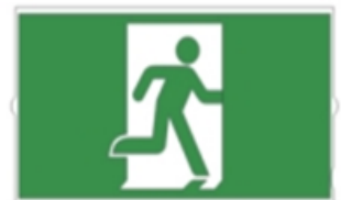
1 pc. without arrow