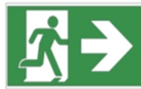
2 pcs. with arrow