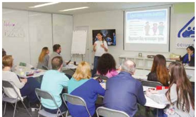
New Education Centre

Today CCI Ukraine has a high level of support, involvement, and interest on the part of camp leaders and staff. It is amazing to see what God has been doing. It is exciting to be part of His work.