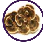
TURKEY TAIL MUSHROOM