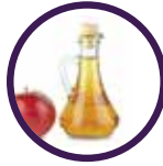
APPLE CIDER VINEGAR