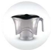
Decanter & Lid