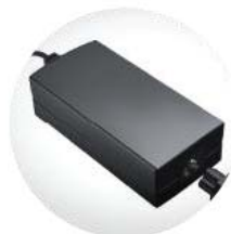
Transformer & Power Cord.