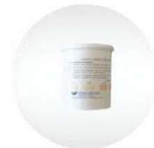
FAC Test Strips