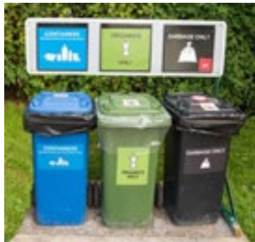
Example of a three stream onsite collection container system.

Businesses that sell products meant for immediate consumption onsite must provide recycling & organics collection containers inside their businesses for their customers.