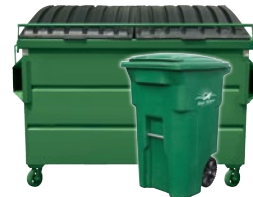
GREEN = ORGANICS