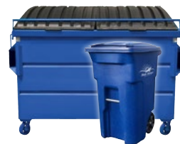
BLUE = RECYCLABLES

Visit our website or www.CalRecycle.ca.gov for more information about Mandatory Commercial Recycling.