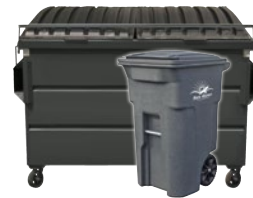
GRAY = GARBAGE