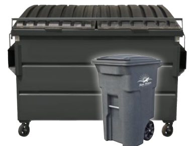
GRAY = GARBAGE