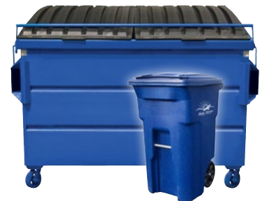
BLUE = RECYCLABLES

Items going in the ORGANICS cart or bin should be free of glass, metal, and plastic.