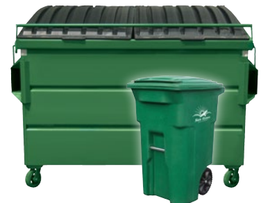
GREEN = ORGANICS