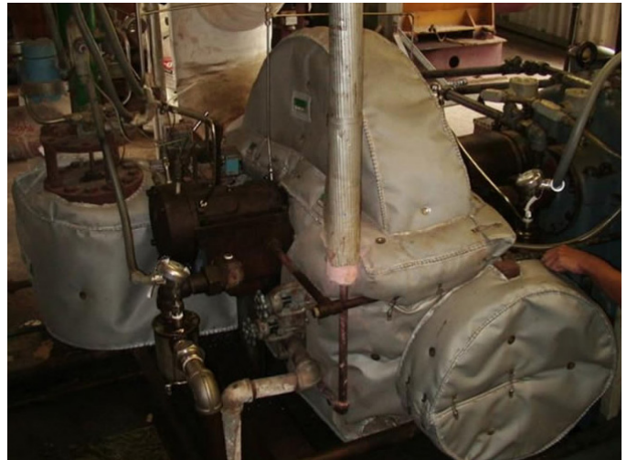
Single Wheel – Steam Turbine

Blanket Overlap: To minimize heat loss, the blanket will extend beyond mating flanges unto existing insulation for a minimum of 2" (5cm). Where blanket cannot fit over existing oversized insulation, blanket will butt up to existing insulation with a friction fit closing seam. All sections of pipes will be insulated and open gaps are not acceptable. Blanket diameters which are 2" (5cm) or larger than existing insulation must be end capped to eliminate open air void.