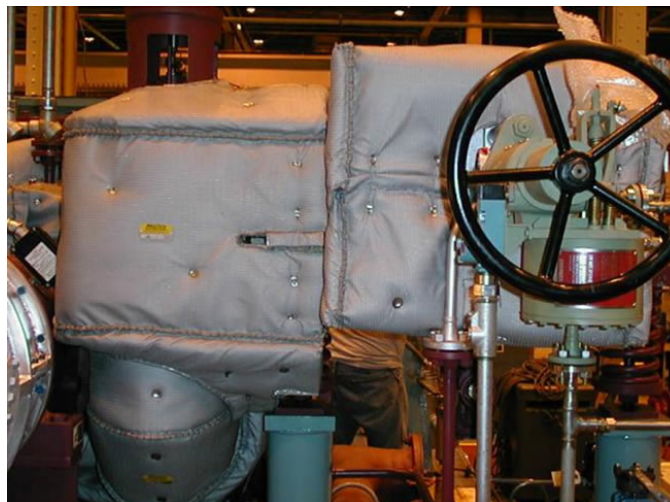
Steam Inlet T&T Valve to Steam Turbine

Leak Accommodations: To accommodate a leak and detect its origin, blankets will have a low point stainless steel drain grommet or the design will incorporate a mating seam at the lowest point of the blanket.