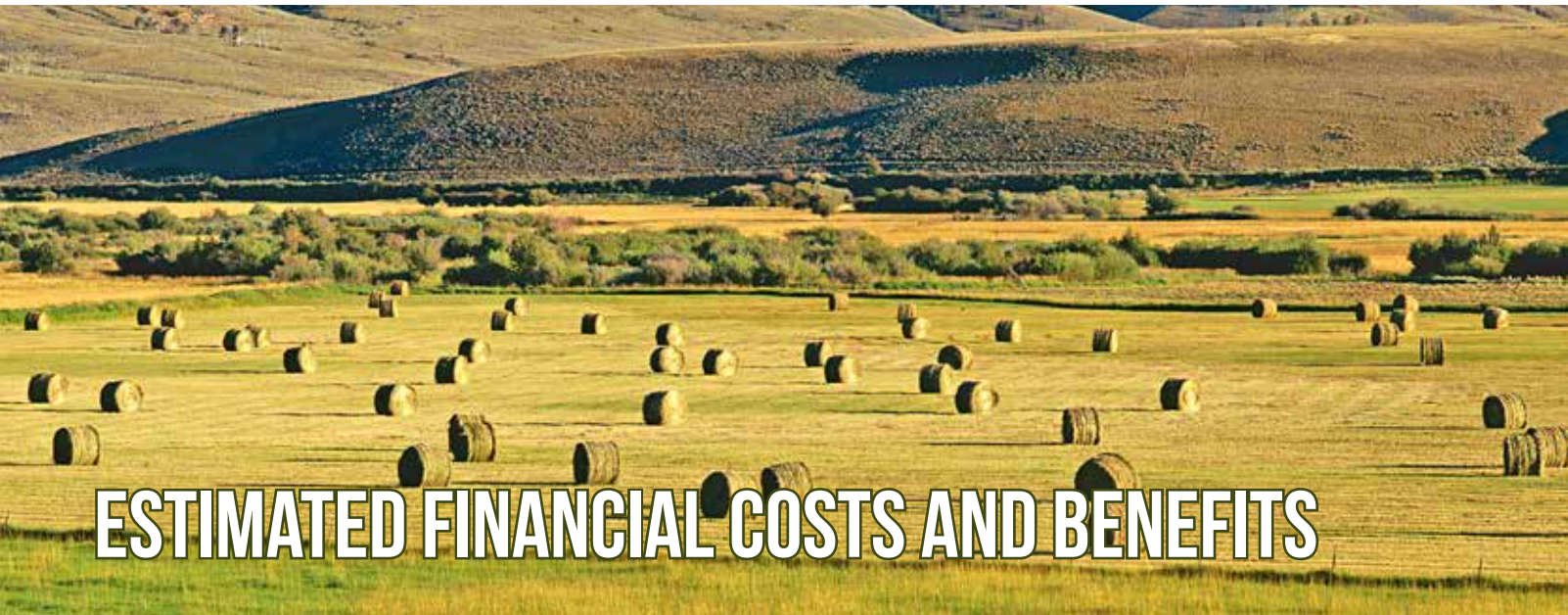
Irby Ranch, Gunnison County