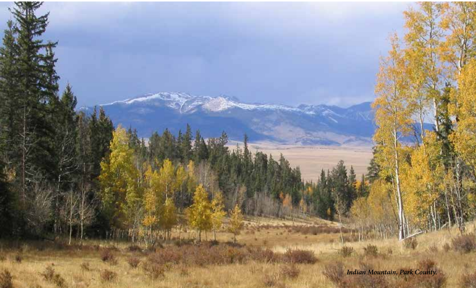
Indian Mountain, Park County.

COL also provides leadership within the conservation community within the state and beyond. COL conducts critical research on emerging issues, such as increasing flexibility for water rights within conservation easements, and regularly conducts presentations on stewardship best practices.