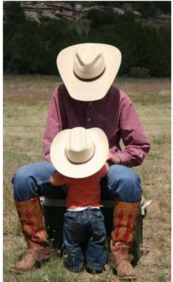
Beatty Canyon Ranch, Las Animas County.

In rare cases, Colorado Open Lands may be able to raise funds through various grant programs to pay for a portion of the value of your conservation easement. These funding programs are highly competitive and different funding sources may require particular restrictions in a conservation easement. COL will work with you to determine if your property qualifies for available funding programs. Even when we can raise funds for a conservation easement, a certain percentage of the value of the conservation easement is typically donated. You may then be eligible for tax benefits, based on the donated value of the conservation easement. This is known as a bargain sale. The bargain sale of a conservation easement is usually at least a three-year process.