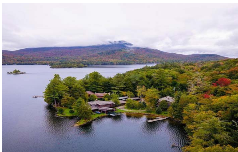
Aerial view of The Hedges lakeside property