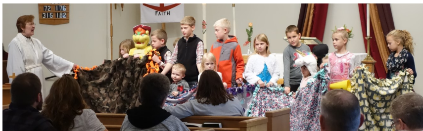
Blessing of the blankets made by kids in Halloween costumes. (Left)