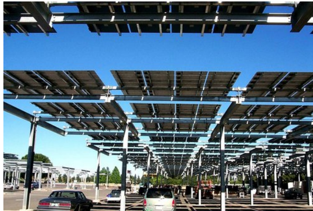
Figure 3. Solar parking lot canopy

Figure 3 shows an example of a solar parking lot canopy.