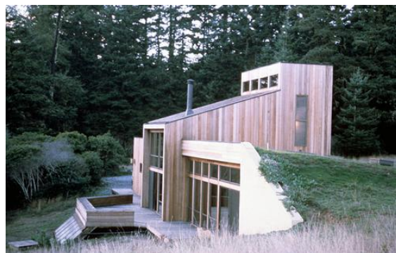
Figure 4. Passive Solar Architecture 36

Figure 4 provides an example of a passive solar residential structure.