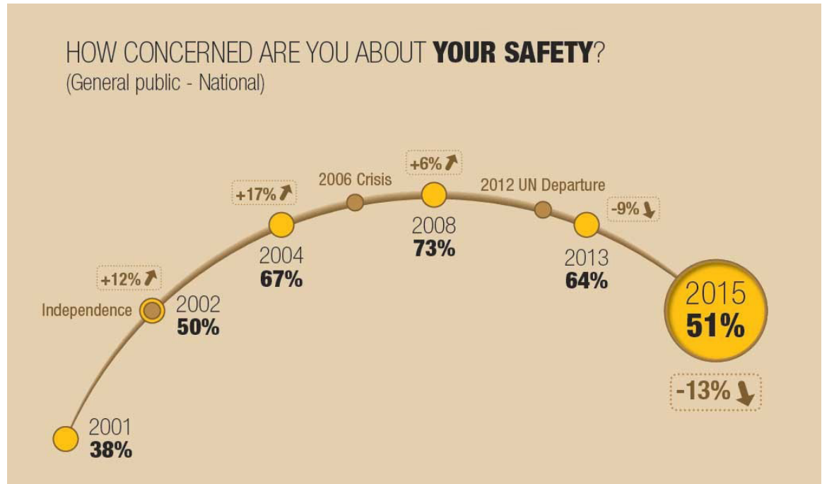
Figure 1: How concerned are you about your safety? Respondents who said somewhat or very concerned (General public - National)