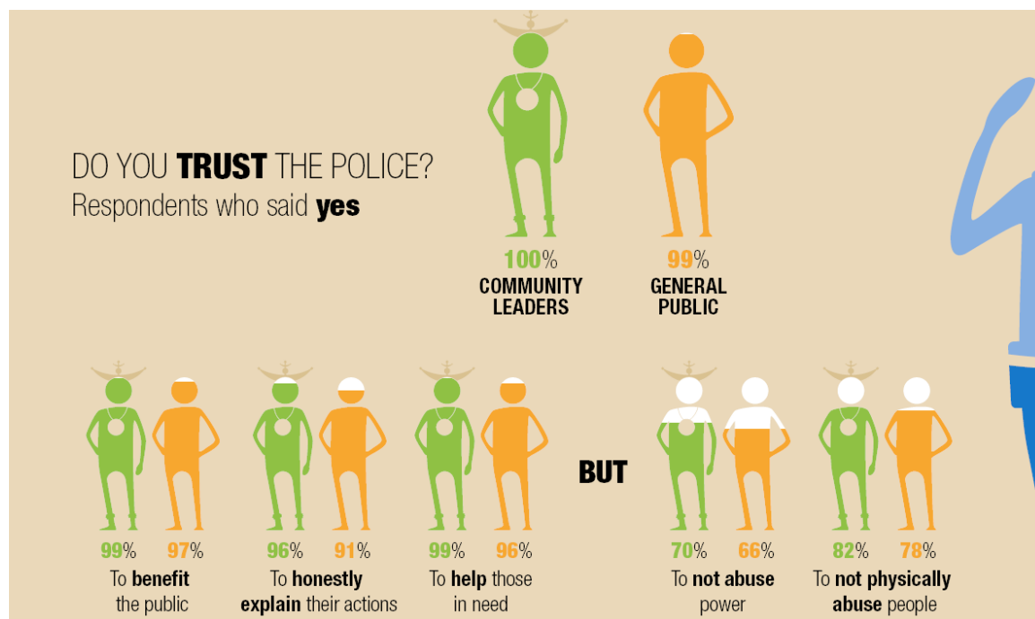
Figure 2: Levels of Trust in PNTL in 2015