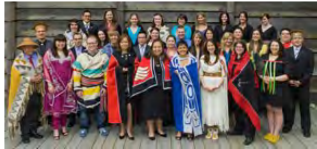
By UBC Public Affairs on May 22, 2012