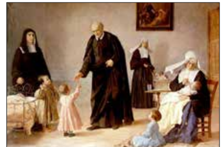
St. Vincent de Paul, September 27