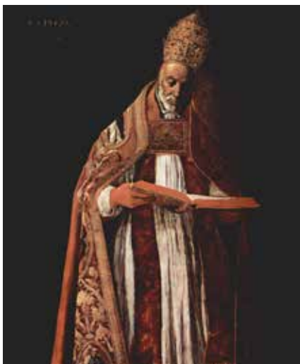
St. Gregory the Great, September 3