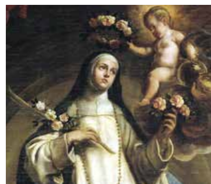
St. Rose of Lima, August 23