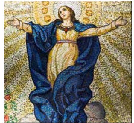
Assumption of the BVM, August 15