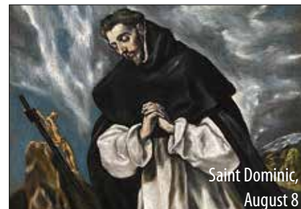
Saint Dominic, August 8