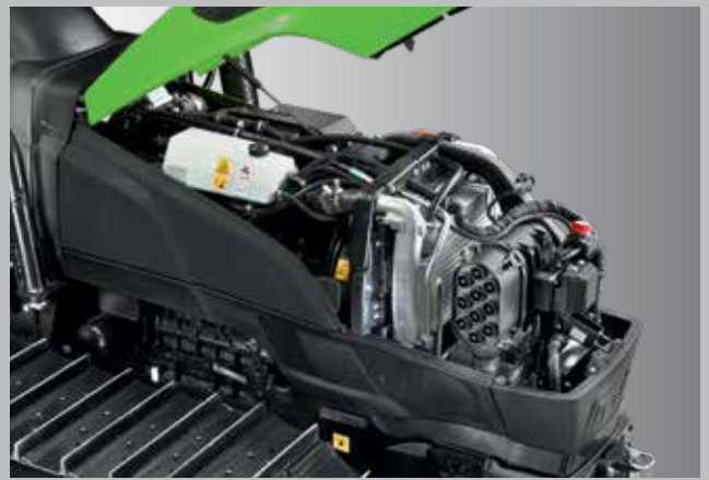
FARMotion diesel engine delivers high torque with "No Maintenance" emissions.