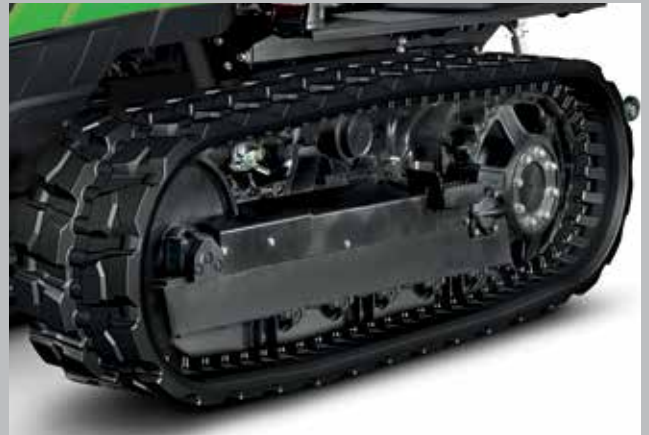
Choice of steel or ComfortTrack rubber tracks by CAMSO® to match your needs and the environment.