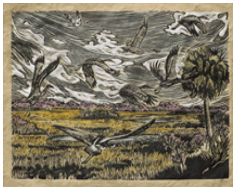
Poster image for 2008

from all over the world including gyros, jambalaya, fish and chips, and barbecue ribs. Are you looking for parking? Two blocks west of Main Street is the City parking garage. It costs five dollars for one day's use, and is open twenty four hours a day.