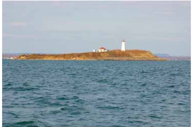
New stone revetment and resloped eastern bluff completed in 2001

The erosion project was a unique engineering accomplishment with major problems and disasters. A floating wharf was built of heavy barges, held in position by giant mechanically driven steel posts. Heavy equipment, trucks, bulldozers, cranes were brought in. A temporary road was built across the island to the eastern bluff, the site of the erosion. A ramp was made for trucks that brought the stone and other materials used to shore up the eroding bluff.