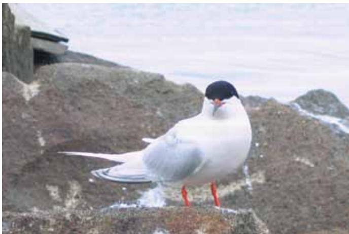
Common Tern Faulkner's Island June 2012