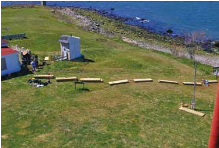
Scouts place new walkway between the stairs and the bunk house

and replaced all the lost tern boxes with assistance from students at Connecticut College, the New London Science and Technology Magnet High School and staff from the National Audubon Society. The blinds were repaired