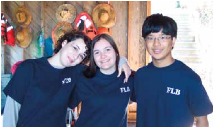
The Junior Brigade at an open house

FLB became a freestanding organization with the approval of their Tax Exempt Status by the Internal Revenue Service in November 2009. FLB was extremely grateful to the Guilford Preservation Alliance for allowing them to be a commission for 18 years.