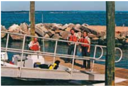
Fish and Wildlife Service crew