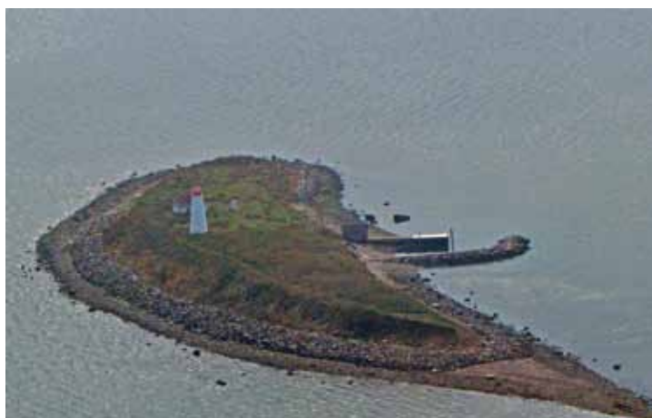
Aerial views of Faulkner's Island post Hurricane Irene

At first glance, Faulkner Island seemed to have weathered the autumn storm well, but closer examination revealed substantial damage to the island's boat basin, shoreline, and some areas of the revetment, undermining the protection it offers. The force of the waves also toppled a section of the breakwater which protects the boat basin. Four and five ton stones were overturned and rolled into the boat basin. This decreased the size and area where it is safe to navigate watercraft. This damage particularly effects the safe operations of large boats entering the basin on low tides. Also, the concrete portion of the pier was severely undermined which created a void completely through the pier measuring approximately 8ft wide and 5ft tall.