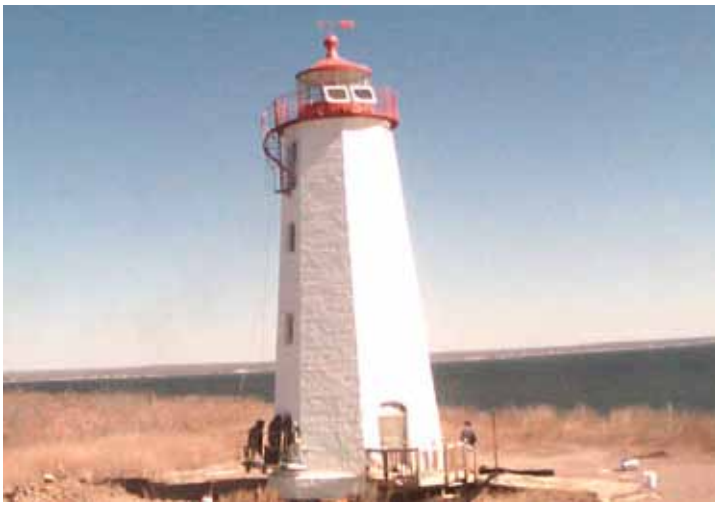
ICC reinstalled the remodeled front door, March 2011