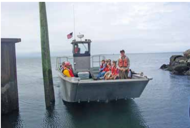
Visitors arriving for Open House visit