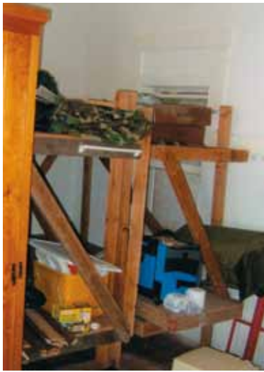
Sleeping facilities for interns

What used to be a one room building, the Generator Building was expanded to house the USFWS interns who study the terns throughout the summer. The expanded facility provides better space for working, cooking and lodging.