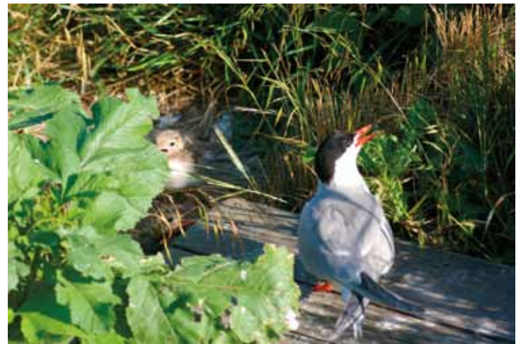
Mom and newly hatched chick.