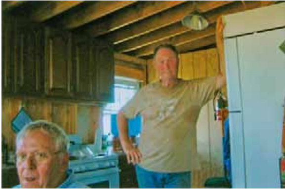
New kitchen facilities