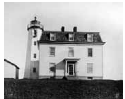
The light & lightkeepers house before the fire.

In March 1976, a fire broke out in the light keeper's house while two Coast Guardsmen were on duty. Fire fighters couldn't get out to island quick enough so the 1871 light keeper's quarters was completely destroyed and the adjacent lighthouse was scorched.