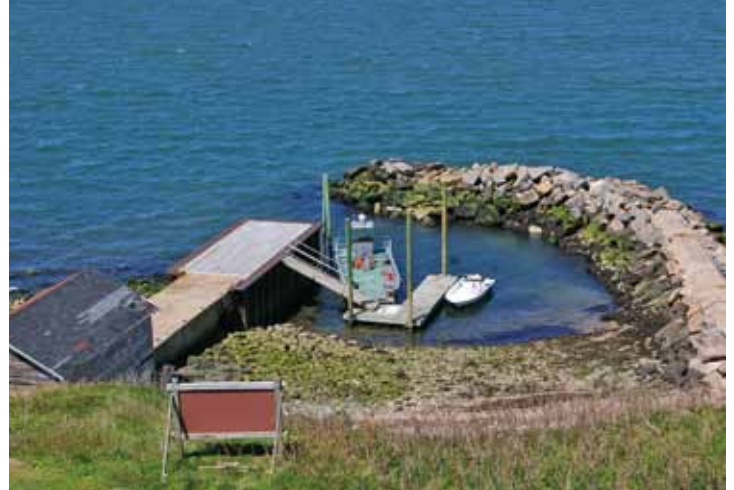
New pilings were placed in the basin in April 2012

by the boy scouts and scout leaders from Hebron, and help in preparing the island for the terns was provided by students from the Sound School (Junior Brigade) and Westbrook High School. Additionally, an Eagle Scout project was launched to construct new boardwalks to facilitate the movement of staff and volunteers around the island during nesting season. Finally a generous contribution from Faulkner's Island Light Brigade allowed the