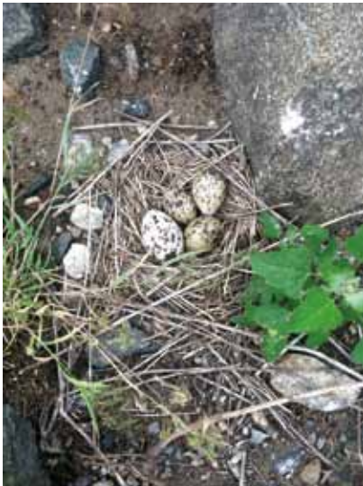
Common Tern nest