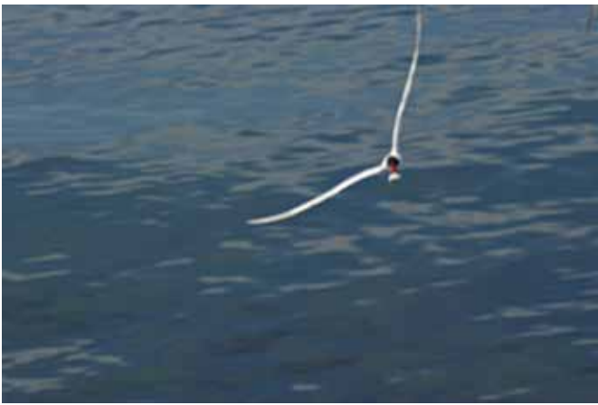
Mom returning to nest with food for her chicks.