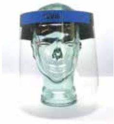
Face Shield by Safilo