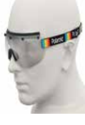
Safety Glasses by Polaroid