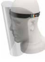
Face Shield by Polaroid