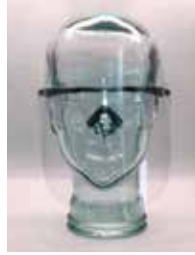
Aegis / Shield by SMITH