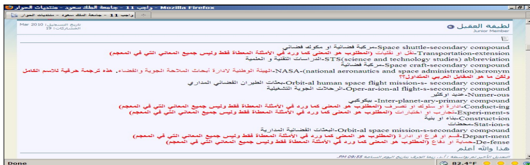
Figure (1): A Sample Assignment with Instructor's Feedback in Red

The author set some policies for using the online Arabization homework such as: Students must use their real names; no nicknames were allowed. Copying and pasting articles were not allowed. They had to give the source of their information. They had to summarize each article in their own words, comment on and give their opinion of the article. They had to use Standard Arabic; use of colloquial language and slang were not allowed. The author set the minimum number of examples, articles and news headlines to be given and specified the length of the articles to be read and posted. She told them how She will comment on the answers and give feedback. She gave credit for participating in the online homework forum. Marks given depended on the frequency of posts. No deadline was set for answering each question.