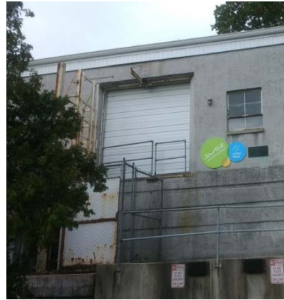
Central Avenue Pump Station (CAPS), Yonkers, NY

As part of a major upgrade to two of this public utility's pump stations in Yonkers and Eastchester, NY, F&A, with Jacobs Engineering, is preparing documentation for necessary approvals including Environmental Assessment Reports for the two sites on Central Park Avenue and Leewood Drive respectively. The reports will include visual and traffic addenda and coordinated meetings with municipal staff. Project approvals will include site plan approvals, variances, special permits and easements before the Yonkers and Eastchester Planning Boards. Project pending.