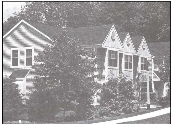
Cross Creek affordable family homeownership project Cortlandt Manor, New York