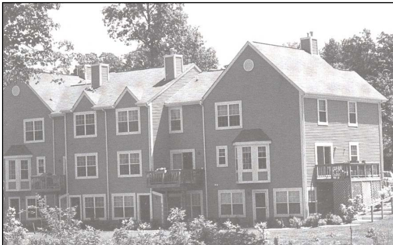
Stone Creek low-to-medium income rental and ownership housing Millwood, New York