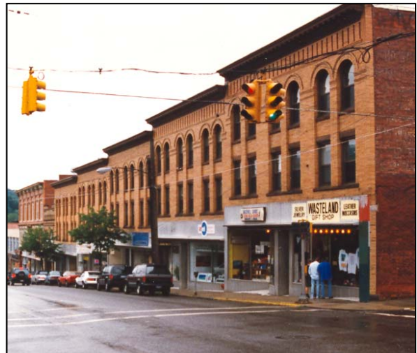
Downtown Torrington Connecticut