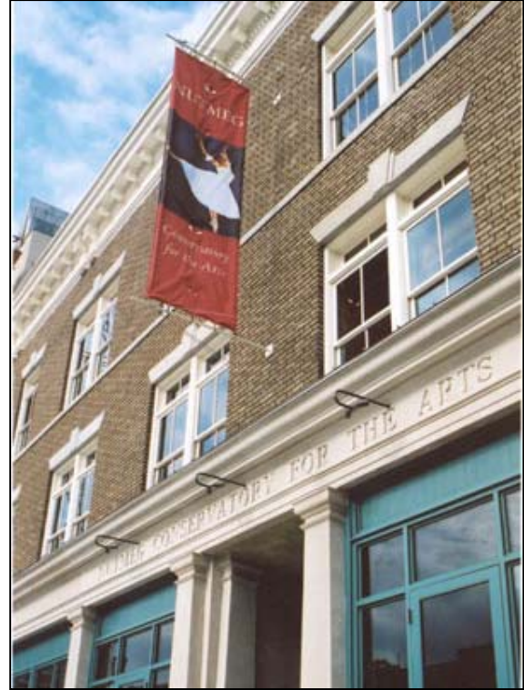
Nutmeg Conservatory for the Arts Downtown Torrington, Connecticut