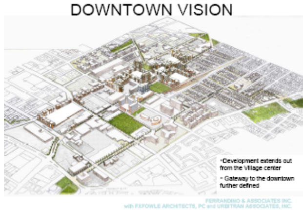
Proposed Downtown Vision Map Village of Hempstead, New York

F&A, with sub-consultants FxFowle Architects, PC and Urbitran Associates, Inc., was retained by the Community Development Agency to prepare an update to the Village's Comprehensive Plan, including a focus on the Village's downtown. This action-oriented, stakeholder-driven plan includes extensive community visioning, land use, zoning and urban design components, such as streetscape and adaptive reuse of vacant and under-utilized buildings, and issues associated with vehicular and pedestrian circulation and parking for the largest village (population 56,588) in Nassau County.