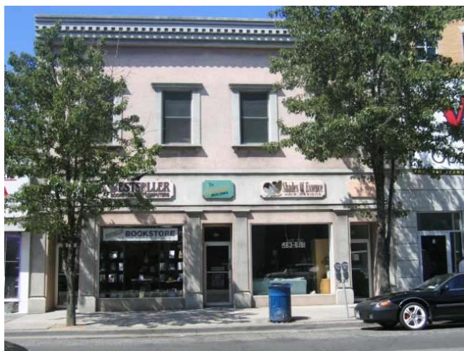
Existing Downtown storefronts on Main Street Village of Hempstead, New York

Long-term components of the Downtown Plan included a capital improvements program and a market study that will assist the Village in conducting business recruitment efforts. Together with representatives of the Village of Hempstead, County of Nassau and State of New York, the F&A team conducted a series of public visioning forums to ensure that the general concerns and needs of the Village's taxpayers were met. The Plan was adopted in 2009 following public hearings and the completion of a Generic Environmental Impact Statement.