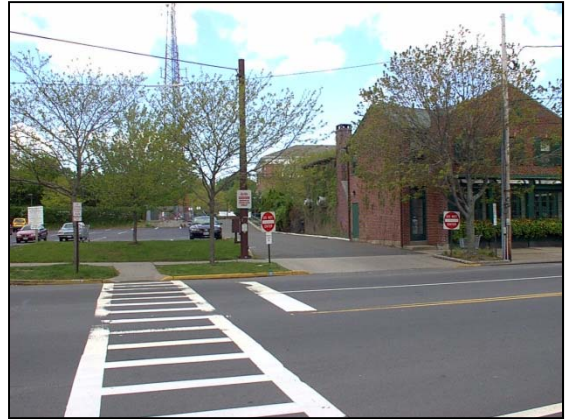
Existing crosswalk on North Main Street East Hampton, New York

F&A prepared a neighborhood plan for the North Main Street area of this upscale East End community. Analysis included an inventory of uses, parking and traffic conditions, streetscape and infrastructure improvements as well as extensive community visioning and an intensive 3-day design charrette. The North Main Street Corridor Study resulted in a plan to improve circulation along the commercial strip, as well as recommendations to amend zoning and suggest design guidelines to make the area more pedestrian friendly.