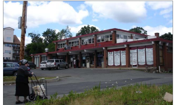
Existing commercial uses on Jefferson

The Village of New Square Community Improvement Council Inc. (CIC) retained F&A to initiate a planning process to develop a “Main Street Revitalization Plan” for this Hasidic community in the Town of Ramapo in Rockland County. During the planning process, development issues and opportunities were evaluated to identify recommendations for revitalization of the business and shopping district located at the west end of Jefferson Avenue in the Village, in an effort to promote economic expansion and improve the ambiance and functionality of the area. Key work tasks included an inventory of businesses, survey of shopping district users, analysis of existing conditions and creation of a vision for the future and strategy for addressing needs and fostering growth.