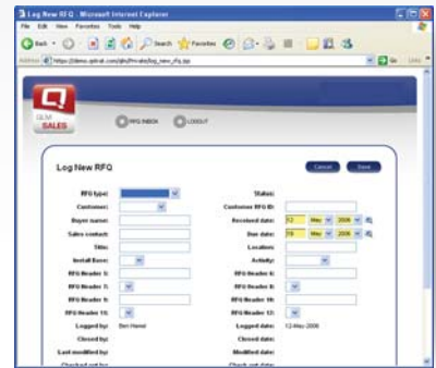
Editable User Defined Fields to collect the data you want to capture.

Analyze information to assess business, sales, and investment performance. Integration with other business/enterprise systems further enhances your quote management activities.