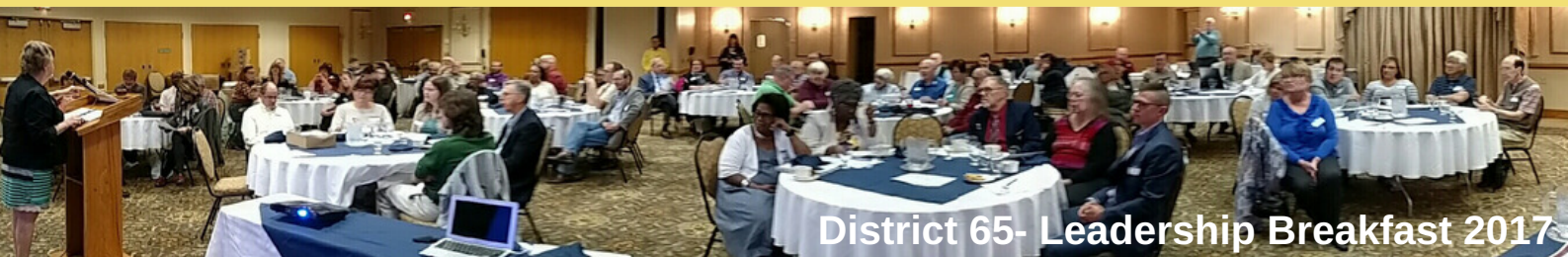
District 65- Leadership Breakfast 2017