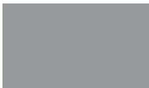
NATURAL w/ LIGHT GREY PIGMENT