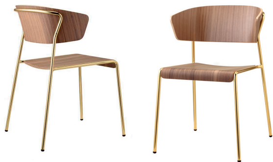
2850 OS NC

Seduta e schienale in multistrato di faggio. Struttura a 4 gambe in acciaio tubolare ø mm 16. Impilabile. Per uso interno.