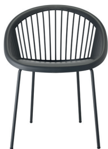
2684 VA 81