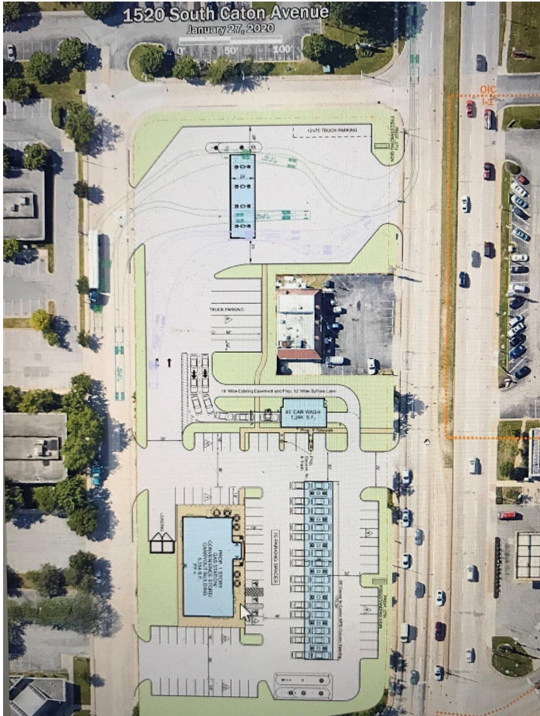
Proposed Royal Farms for Joh & Caton Ave Former Brightwood College Location (Bottom: Joh Ave Right: Caton Ave)