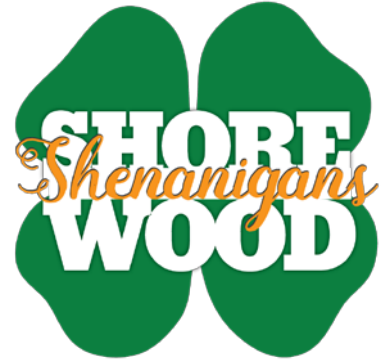
Photo album on FB. Adding to website

Very successful event, attendance much larger than expected. Very positive feedback, most feedback requested more space (close down a second block) and more kid friendly activities for next year.