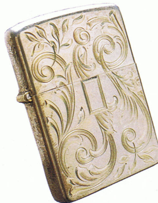
#31 C, obverse, $275-$350

#31 D1 - Box that Sterling Roy Rogers came in.