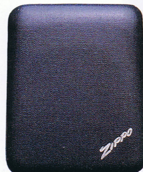
#31 D1, box is valued @ $25.