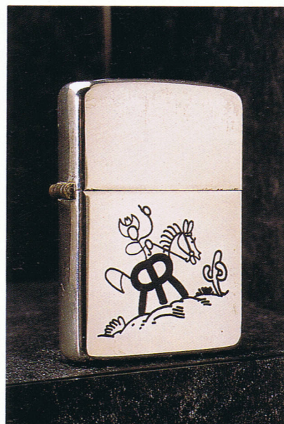
#31 D, only one known to exist in any condition. $1500 in mint condition.