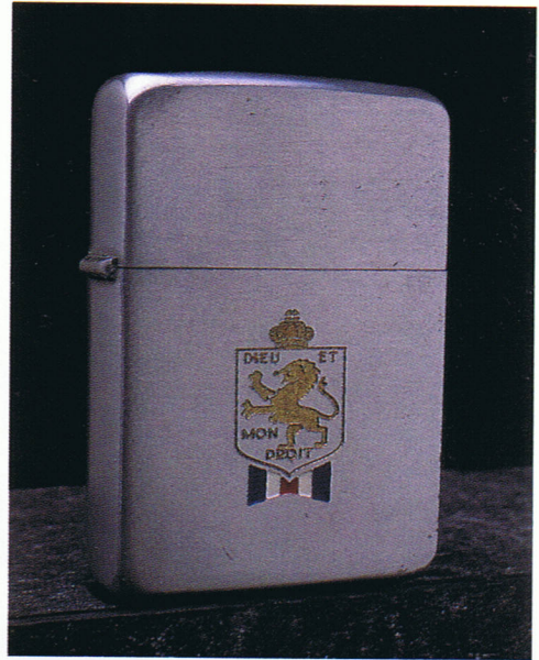
#13 B1, $225-$300

In 1942 Zippo produced an irregular model with a #203695 patent number. This patent number lacks the number 2 between the numbers 3 and 6. It was only produced in 1942. The black crackle paint has to wear off on the bottom of the lighter to identify this model. These 1942 models can be found having military insignias, engraved initials, and engraved Sports motifs, which were produced by Zippo.