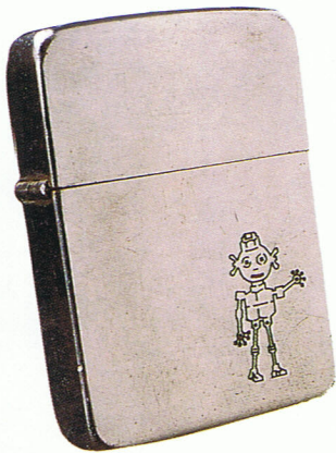
#11 C1, $400-450