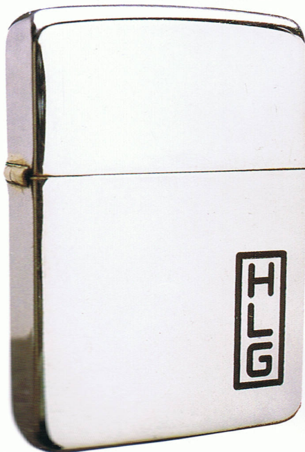
#10 E, $400-$450