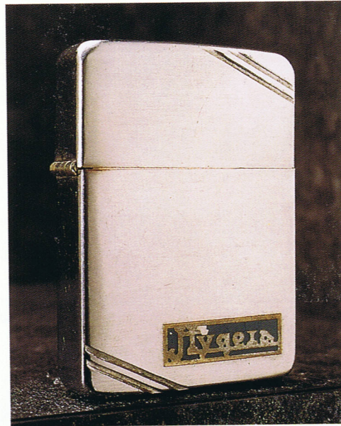
#10 D, $450-$500