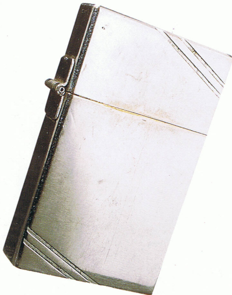
#2 A, closed, $7,500-$9,000

#2 E - This lighter does not have the original hinge on the case or the original piston in the insert. The hinge, piston, cam and flint wheel have been repaired and replaced by Zippo. The piston is replaced with a flat or humped spring.