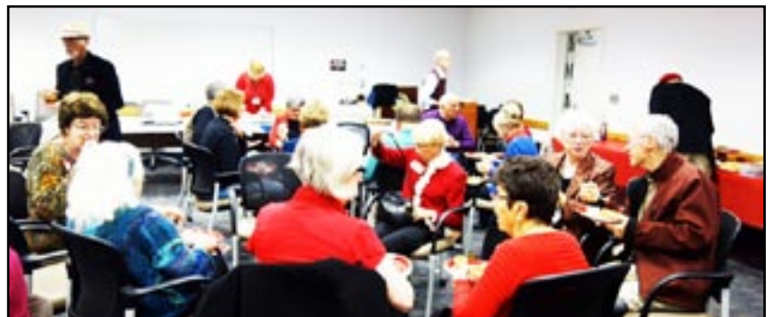
SDWEG's 2017 Holiday Party on December 11 was delightfully convivial. It was a fine ending to a great year for the Guild.