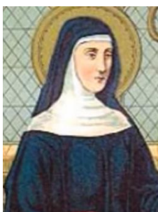
St. Scholastica, twin sister of St. Benedict, February 10