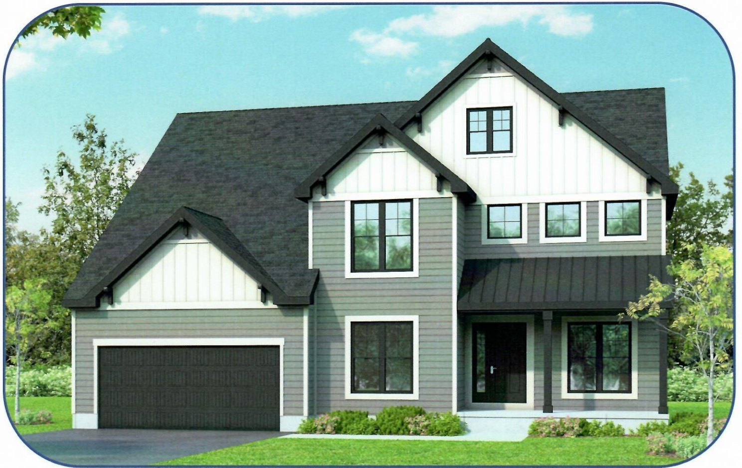
Elevation C Approx 3380 sq.ft.

Jeff Whiting (614) 202-9763 jeff.whiting@trinity-homes.com www.OHNewHomes.com