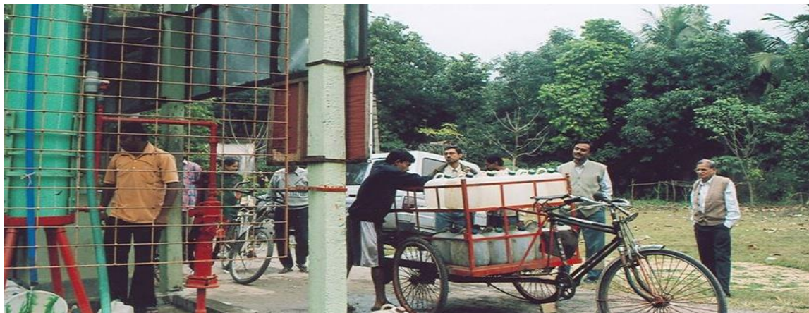
Delivery Vehicle for Water Home Delivery

If CWB can demonstrate that this model provides safe drinking water to the residents of Sitakunda Upazila, it could be used as a template to offer a low cost solution to the arsenic contamination problem nationwide in Bangladesh. Chemical expertise is essential, since accurate measurement of arsenic and other contaminants depend on proper collection and testing procedures. The chemical behavior of these contaminants in water is complex. However, except for a few chemists and managers to oversee the project, all of the work can be done by students and young adults. University students and recent graduates are educating and training high school students. Then the high school students test the community wells near their schools and inform their families and neighbors. A small fee will be paid for the water home delivery. We are enabling the power of youth to help resolve a critical health problem that has persisted for a generation in Bangladesh.