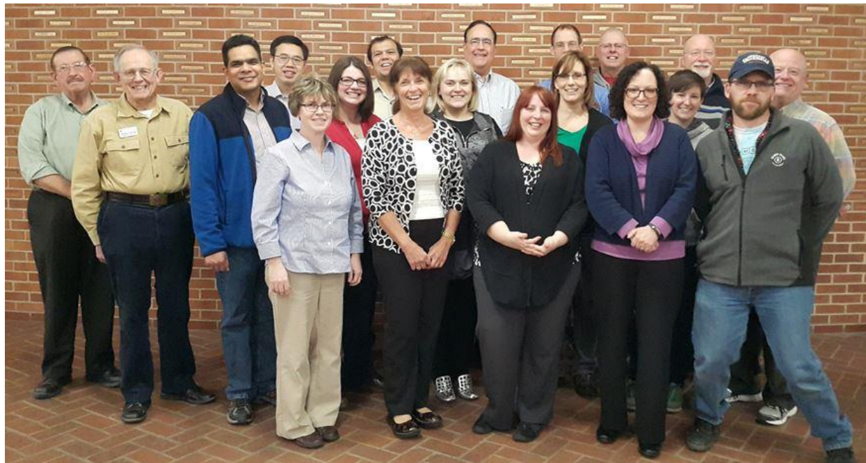
Photo of the members of the 2017 Midland Section ACS leadership team taken at the Monday, March 6, 2017 Board meeting held at the Midland Center for the Arts.