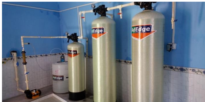
Arsenic Removal Equipment

The solution may be a ring well that brings up uncontaminated water from an aquifer near the surface, or it could be equipment that removes arsenic and other contaminants from the water.