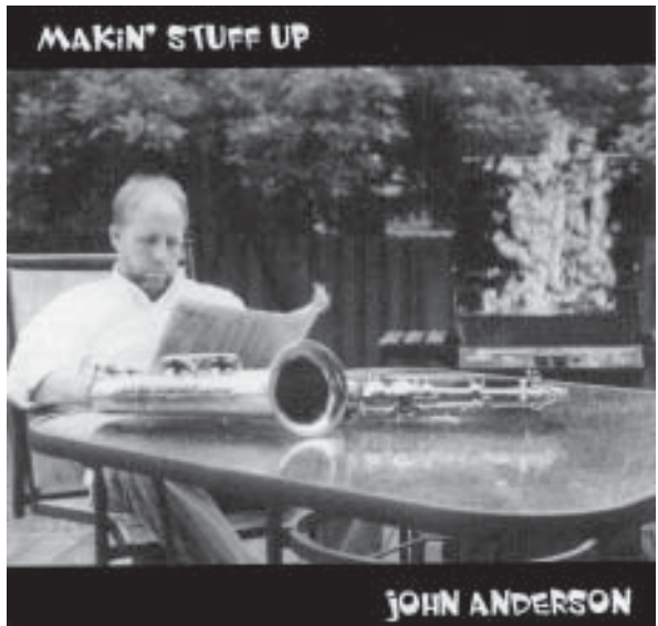
Cover art from John Anderson's latest CD.