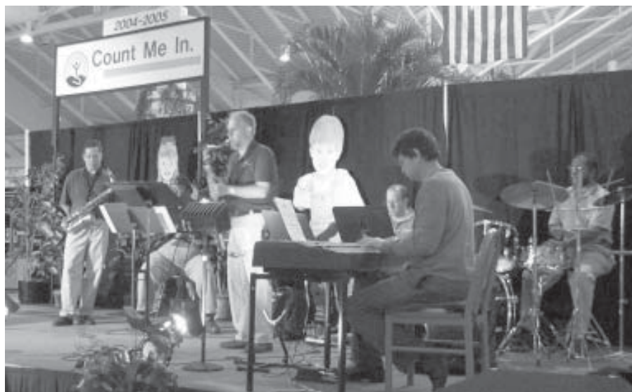
The Dow Jam Band features numerous local technical professionals. Here the band performs at the September 17 kick-off for the 2004 United Way campaign.

Our numbers of musical chemists might not convince anyone that there's a strong connection between science and music, but consider the following statistic. Nearly 100% of past winners in the prestigious Siemens Westinghouse Competition in Math, Science and Technology (for high school students) play one or more musical instruments. These students tend to be highly skilled in both music and science. This led the Siemens Foundation to host a recital at Carnegie Hall last year featuring some of these young people, after which a panel of experts debated the